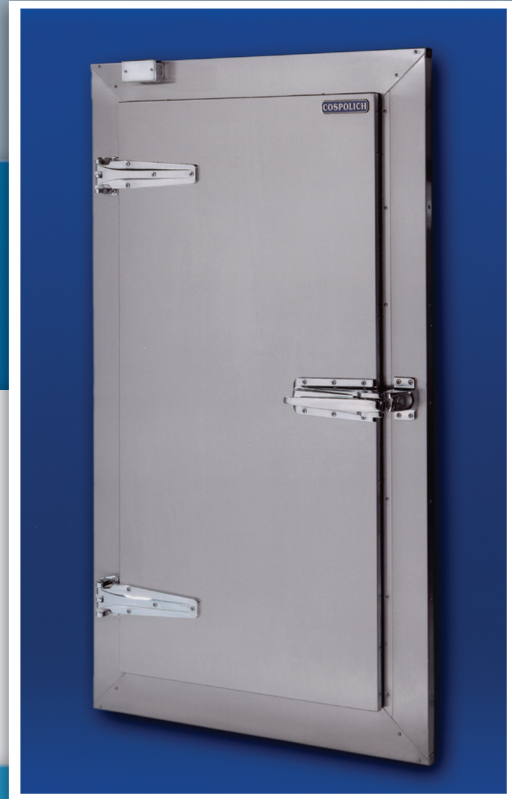
Standard Commercial Marine